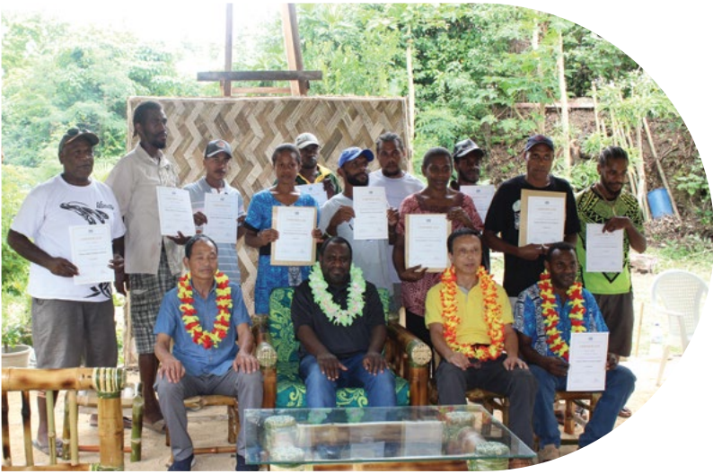
Farmers and entrepreneurs in Vanuatu receiving training to promote the value-added bamboo industry